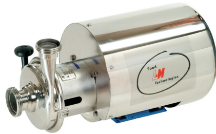
Sanitary centrifugal pump "PLC"