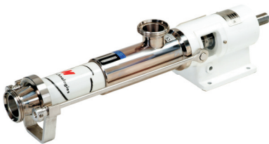
Eccentric screw pump "LMHS-CIP"