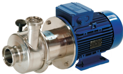
Centrifugal pump "HGX"