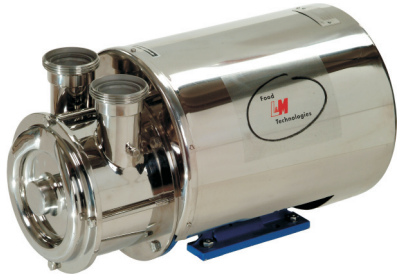
Self-priming pumps "ASP" & "ASPZ"