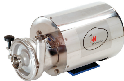
Centrifugal pump "ES"